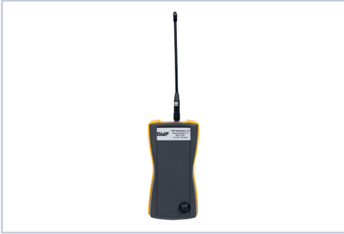
Radio receiver MBW BLUE

Readers with radio can be read out efficiently in «Drive-by» mode. The mobile device is connected with the mobile radio receiver via Bluetooth. Meter readings are attributed to the meter on receipt. The meters that have already been read out are automatically hidden on the map. This way, the map always provides the reading technician with an overview of the addresses where meters still need to be read out.