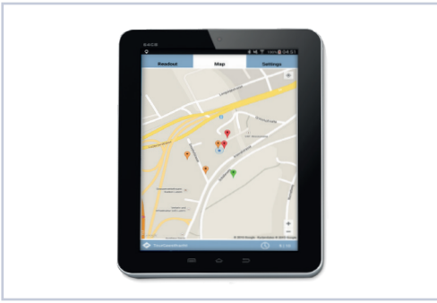
MEx Tablet (map view)