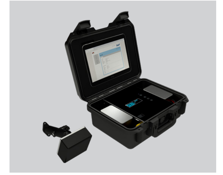
Q-Eye radar with mobile transmitter

The three-person urban drainage team at SH POWER plans, builds and maintains the wastewater system and its facilities such as storm water tanks, storm water overflows, storage and interceptor sewers as well as official infiltration and retention facilities in the Schaffhausen region.