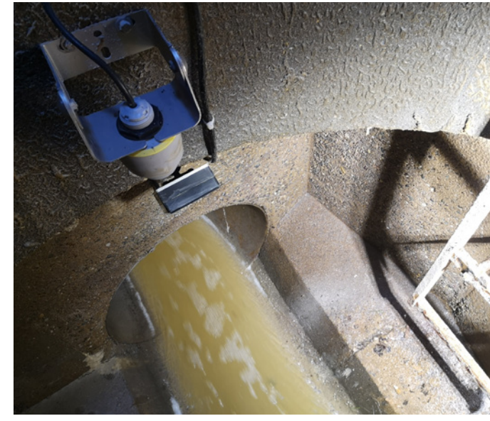
Installation in the field extendable to continuous operation