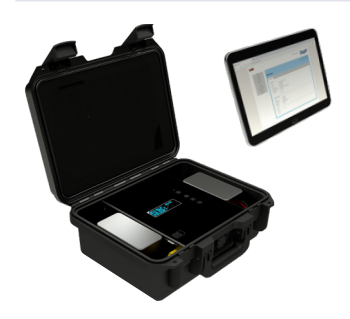
Mobile transmitter case

The Q-Eye PSC Portable transmitter comes in an IP67 case ready for use in harsh environments, e.g. in sewer networks. The instrument can be read out without opening the case by simply activating Wi-Fi transmission. There is no need to connect any cable for data download or configuration.